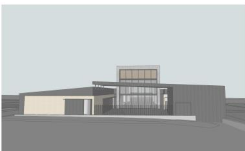
This picture is looking from the Senior Campus towards the building.

I have included pictures in this week’s newsletter. The colours are not accurate in the pictures as a working group is still proceeding with this. I am not part of this group as my focus is more on what happens inside the building and, to be honest, my contribution to the colour scheme is going to be minimal.