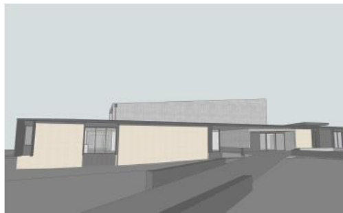
This picture is looking from the Senior Campus Carpark.