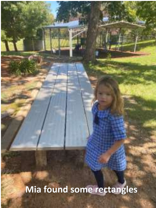
Mia found some rectangles

In maths one of the concepts we have been enjoying is 2D shapes, we went on a shape hunt around our school and discovered lots of shapes hidden around.