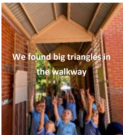
We found big triangles in the walkway