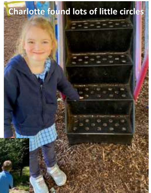
Charlotte found lots of little circles