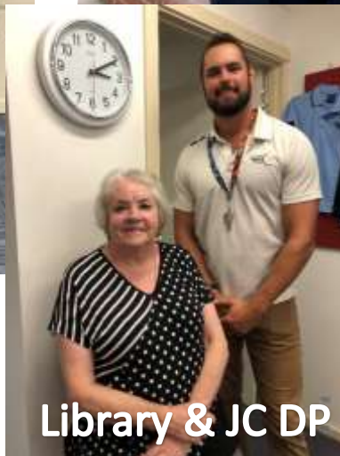
Library & JC DP