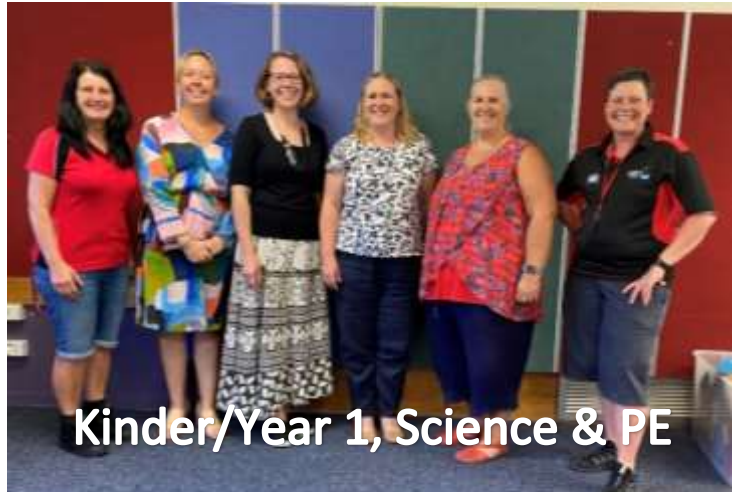
Kinder/Year 1, Science & PE