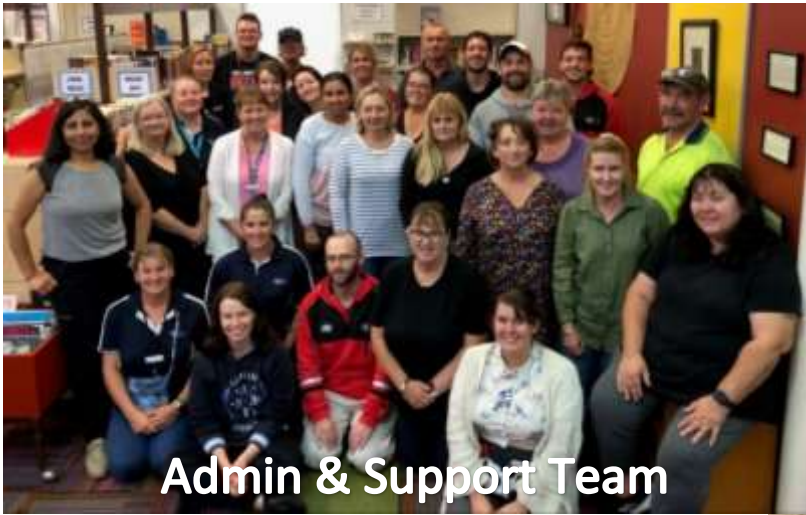
Admin & Support Team