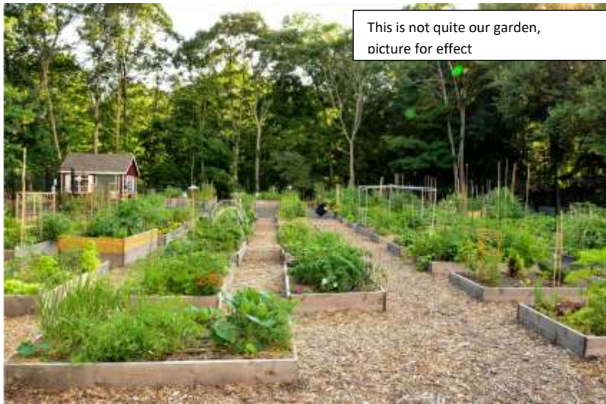
This is not quite our garden, picture for effect

For more information please contact Sharon on 0402 944 723